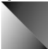
extra clear graphite